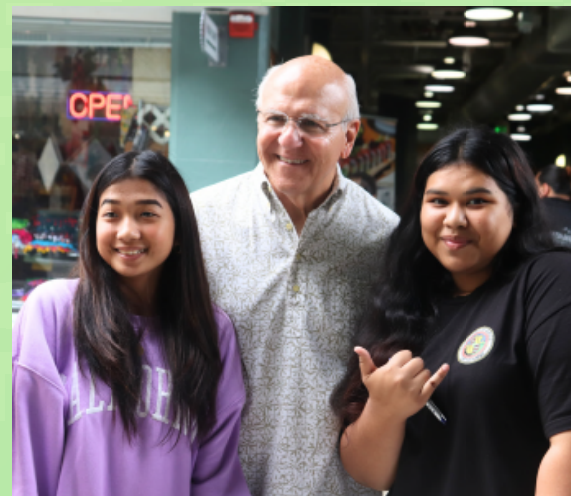
WORKHAWAI'I WIOA ADULT, DW, YOUTH, & QUEST JULY 2024

"I actually was involved with WorkHawai'i as a client, and I loved it because I had access to the tools I needed, such as the computer and the networking that it offered, and it was great... They help you do your résumés, they give you advice and direction on how to go through the process, how to apply for jobs, even some training, too. Because I have the experience and I went through the program, I can also let our applicants know, 'Go through WorkHawai'i, it's a great benefit' and now I'm working for Hawai'i Public Housing Authority."